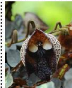
Darth Vader flower