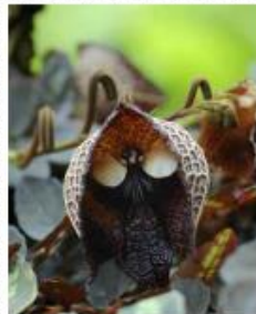
Darth Vader flower