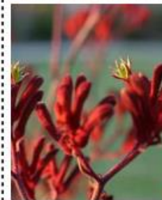
Red kangaroo paw