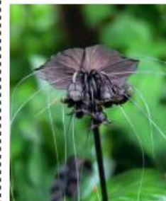
Black bat flower