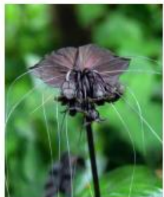
Black bat flower