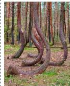
Pine trees in the Crooked Forest