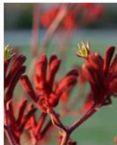
Red kangaroo paw