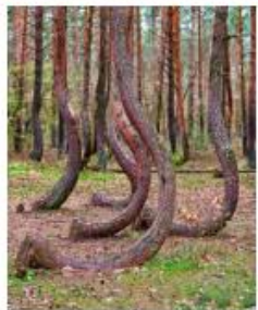
Pine trees in the Crooked Forest